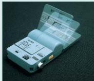
Adjustable "Flip-Top" Display