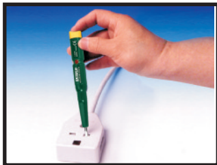
Voltage check in an outlet