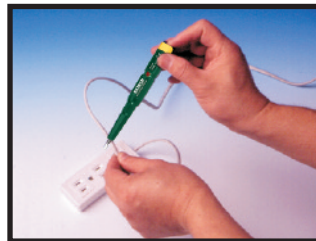
Checking for open wires in cables