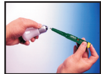
Light Bulb Continuity Check