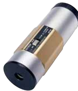
Optional Precision Calibrator 94dB/114dB fits 1/2" or 1" microphones - enables user to calibrate through the microphone