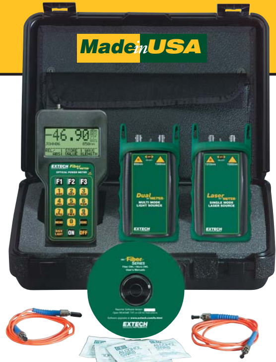
FO600ST2-kit Shown Above