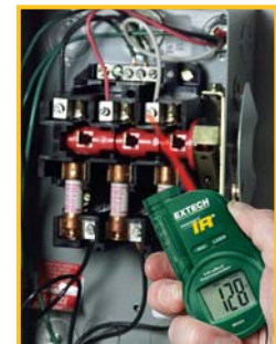
Troubleshooting for hot spots