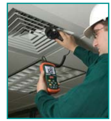
AN100 and AN200 used in HVAC applications measuring airflow from heating vents.