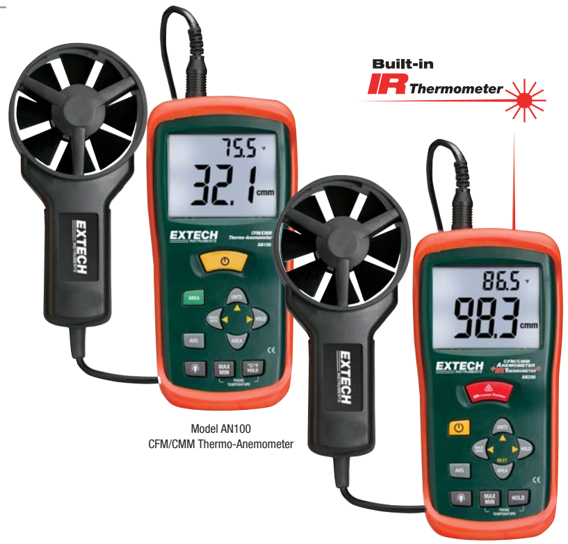
Model AN100 CFM/CMM Thermo-Anemometer