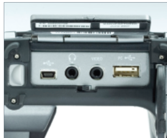
From Left to right: USB mini for PC image download, 4 pole audio for voice annotation, NTSC video, USB-A for memory stick image transfer