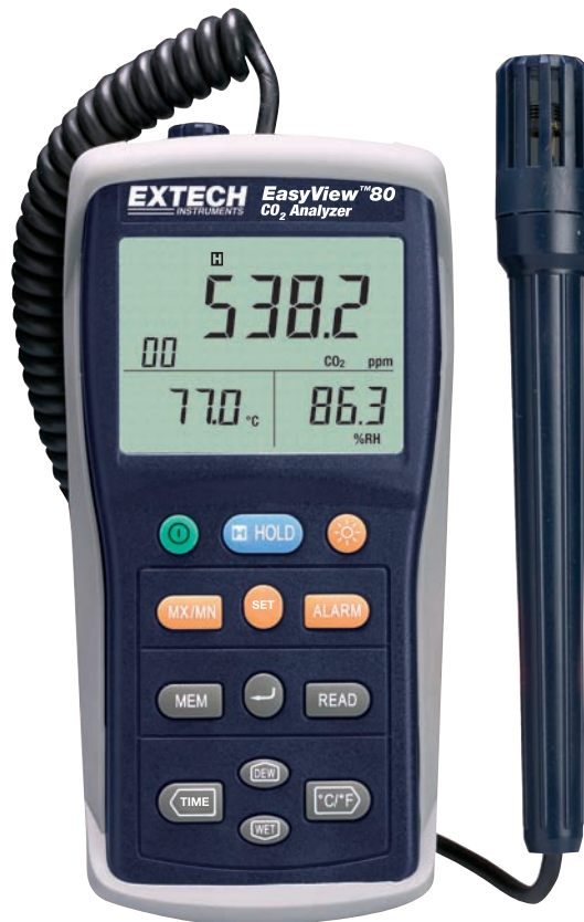
Not For Export