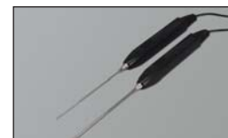
881603 and 881604 immersion probes