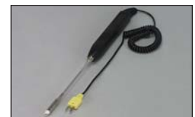
881602 surface probe